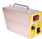
Salt particulate generator